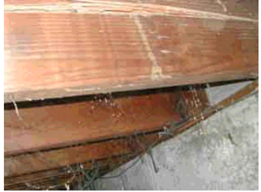
Damaged floor joists under kitchen.