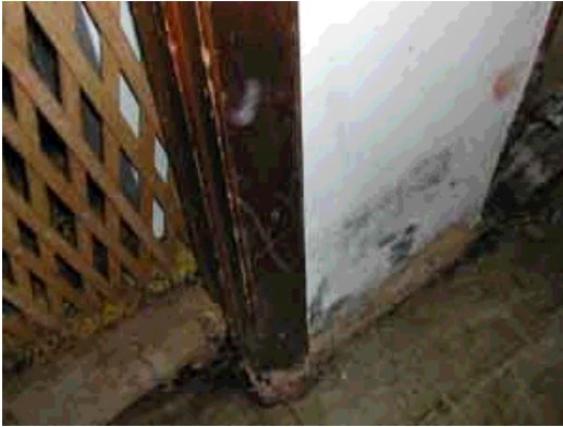
Fungi growth in laundry room.