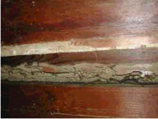
Mud tubes in basement door jamb.